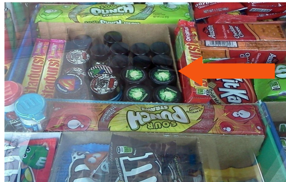
Small plastic containers of Spice displayed with candy at a gas station.