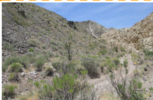
High Desert Community Change Program A program of the Institute for Public Strategies

The SAFE Coalition is a group of local parents, business people, educators, health professionals and others advocating for effective solutions to reduce problems related to alcohol and other drugs in Barstow. Membership is open to the public. For more information on how to become involved in the SAFE Coalition, email SAFEBarstow@Gmail.com .