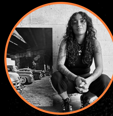
FEDELLA MEDIA ASSOCIATE