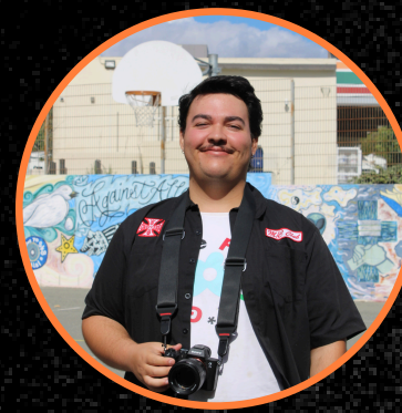
ISAAC MEDIA ASSOCIATE